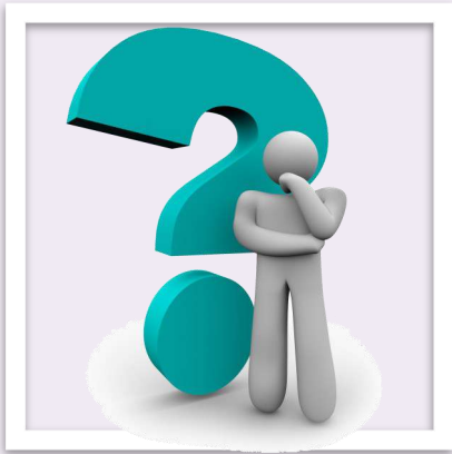
Member to be Revealed in Next Newsletter